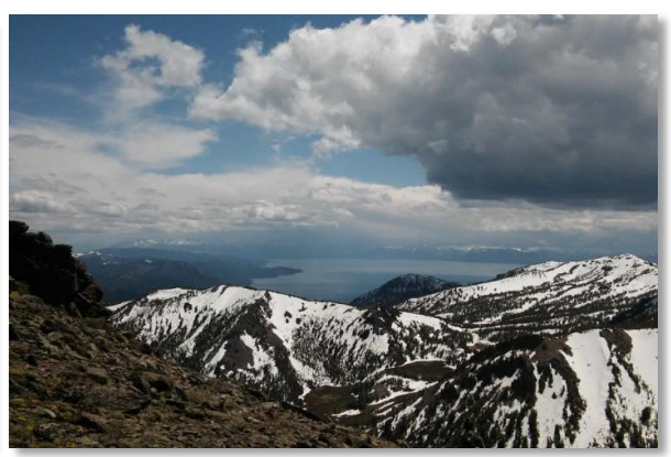
Weekend trip to Lake Tahoe